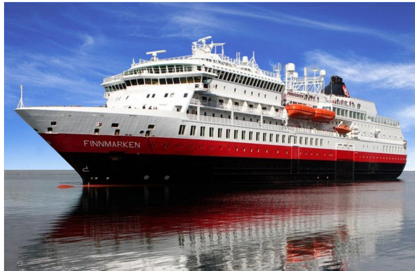
Ship: MS Finnmarken (B/D)

Morning at leisure for own arrangements Afternoon guided tour of Bergen including views of St Mary's Church and Haakon Hall, visit to the fish markets and the old Hanseatic wharf at Brygge, and Troidhaugen to visit the Edvard Grieg Museum Tour ends at the pier in time to board Hurtigruten ship Buffet dinner on board