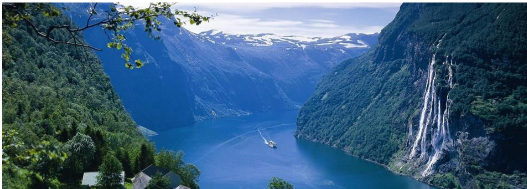
Ship: MS Finnmarken (B/L/D)

We sail further north to Alesund, a beautiful town renowned for its Art Nouveau architecture. From here we set course into the spectacular UNESCO-listed Geirangerfjord where you can enjoy a scenic excursion including a breath-taking drive down the winding Trollstigen Pass.